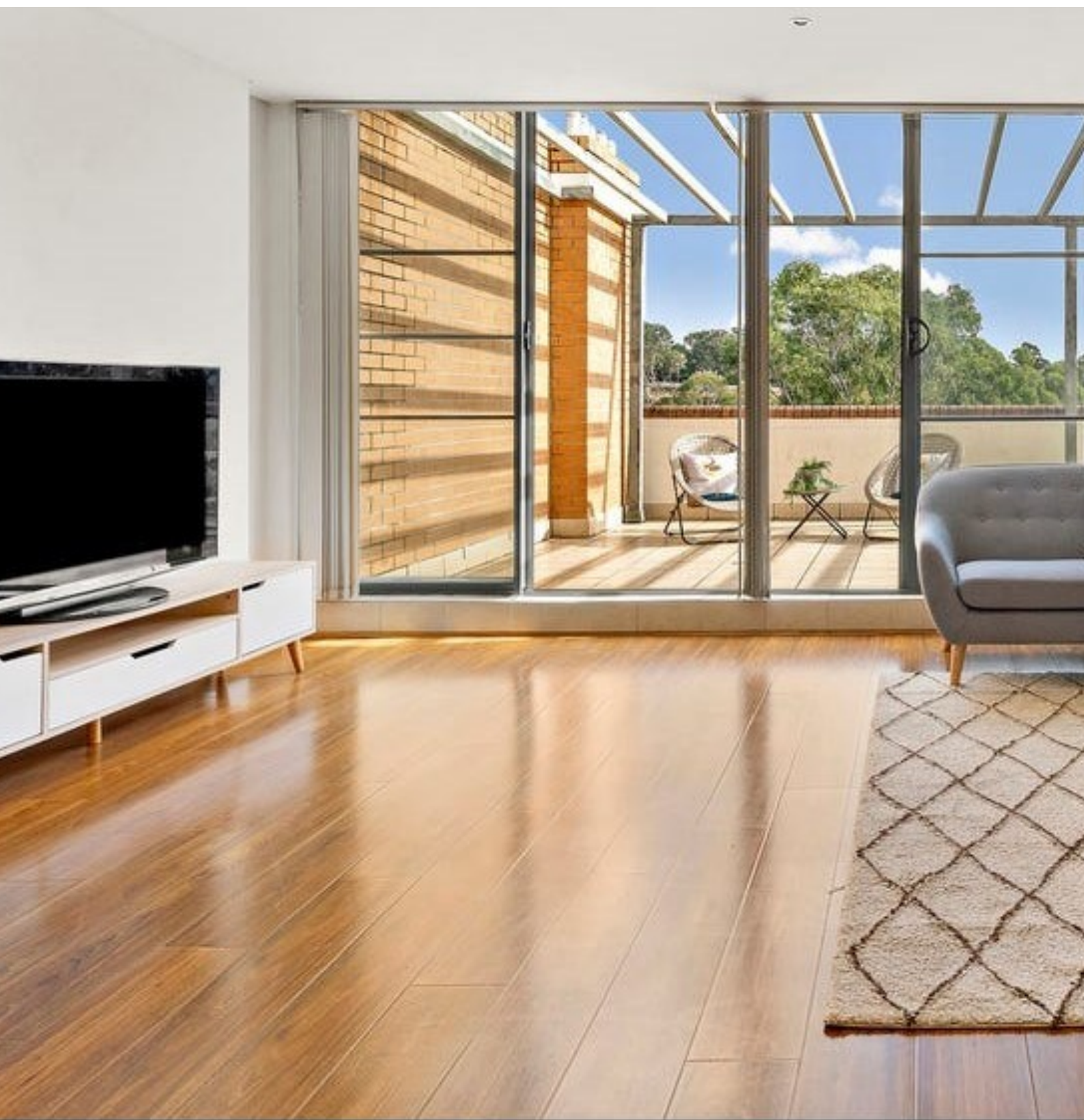
OZ2503 Spotted Gum