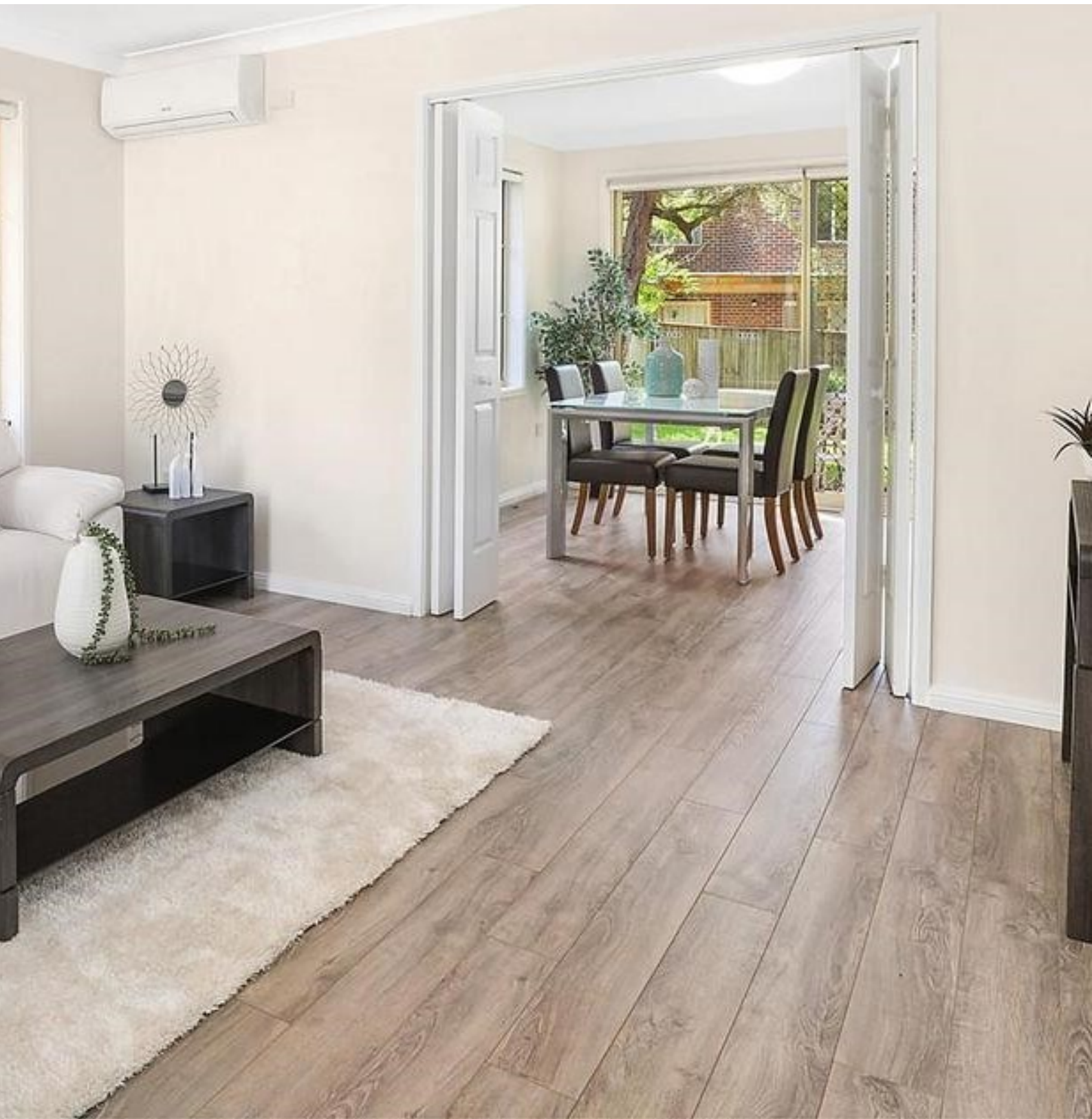
OZ2003 Vintage Oak