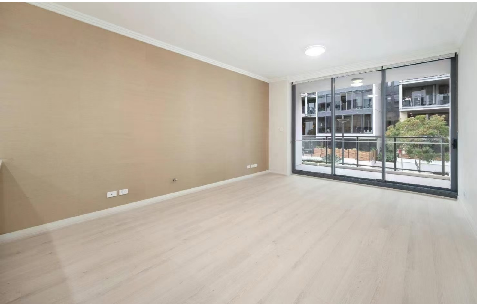
OZ2628 White Oak

Perfect for both contemporary and classic interiors, White Oak pairs effortlessly with a wide range of colour schemes and design styles.